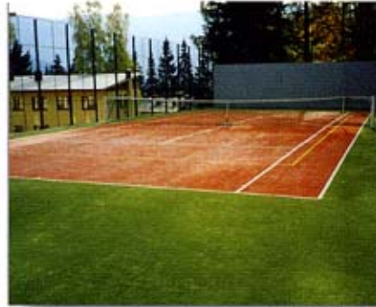
Worn Synthetic Grass